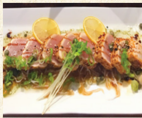
Tuna Tataki Sashimi