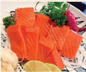
Sockeye Salmon Sashimi

3 salmon, 3 tuna, 3 sockeye salmon, 3 toro, 3 hamachi, 3 tuna tataki, 2 hokkigai, 2 tako