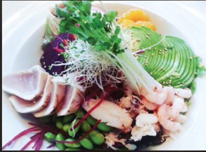
Wara Dream Salad